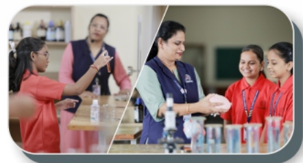
STATE-OF-THE-ART LEARNING SPACES