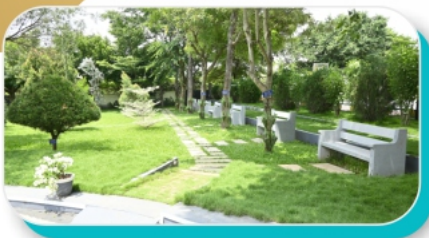
SPRAWLING LUSH GREEN CAMPUS